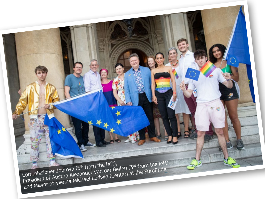
Commissioner Jourová (5 th from the left), President of Austria Alexander Van der Bellen (3 rd from the left) and Mayor of Vienna Michael Ludwig (Center) at the EuroPride.

people will be better protected from audiovisual content that incites hatred or violence, including on grounds of sexual orientation, whether online or on traditional TV. For instance, Member States have to ensure that video-sharing platforms take appropriate measures to protect users from such content. It is important to underline that the new obligations for these platforms do not constitute a limit to freedom of expression, as the envisaged measures do not require any prior general monitoring of content which would not comply with the E-commerce Directive. The AVMSD's provision on audiovisual commercial communications prohibiting any discrimination based on sexual orientation will also contribute to a fairer image of the LGBTI community. This standard will now apply to online video-sharing platforms when they commercialise advertising themselves. They will also have to include this standard in their terms and conditions so that it is respected by their users for the content they upload. The directive set 19 September 2020 as the deadline for transposition by the Member States.