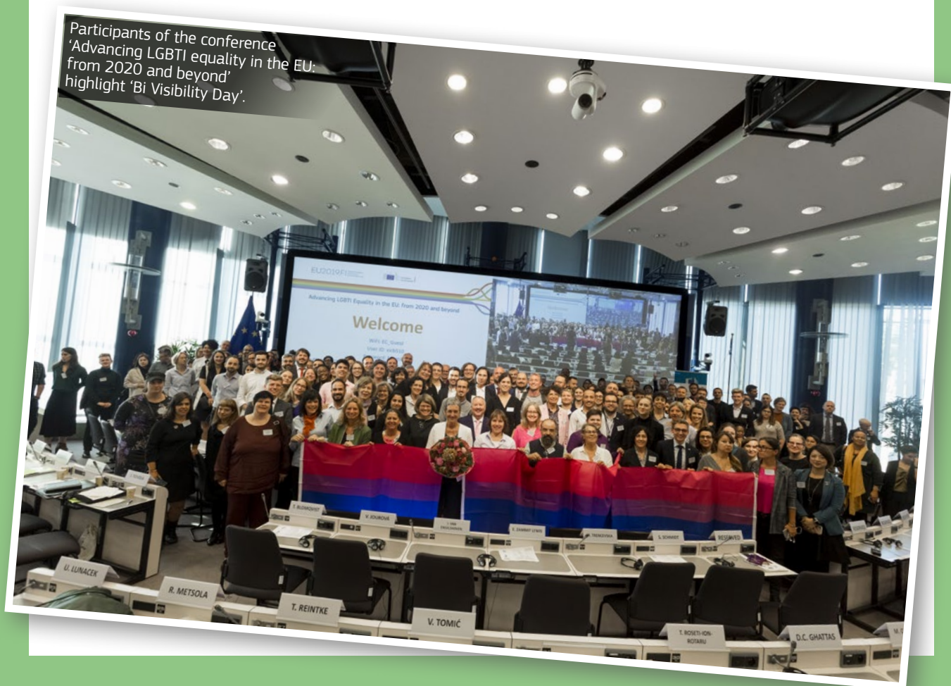
Participants of the conference ‘Advancing LGBTI equality in the EU: from 2020 and beyond’ highlight ‘Bi Visibility Day’.

The Commission closely followed the World Health Organisation’s process to complete the 11th Revision of the International Classification of Diseases (ICD-11) which was endorsed by WHO Member States on 25 May 2019 and will come into effect on 1 January 2022. ICD-11 reclassifies the former ‘gender identity disorder’ diagnosis as ‘gender incongruence’.