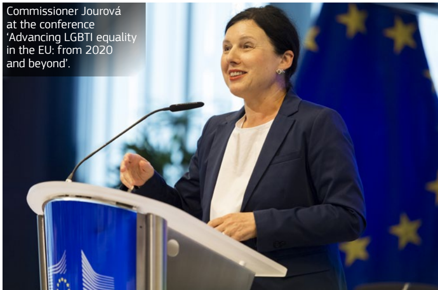
Commissioner Jourová at the conference 'Advancing LGBTI equality in the EU: from 2020 and beyond'.

• Hate crime and hate speech: Through the High-Level Group on combating racism, xenophobia and other forms of intolerance 12 , the Commission continued to support national authorities' efforts to improve responses to hate crime and hate speech, including of homophobic and transphobic nature. In 2019, the group agreed to create two additional working groups to assist national authorities implementing existing guidance in the area of hate crime training and support for hate crime victims. Moreover, based on the good progress made towards improving national methodologies for recording and collecting data on hate crimes, the FRA will continue its work with Member States through a new working group on hate crime recording, data collection and encouraging reporting. The group will aim to support Member States in improving their hate crime recording and data collection, including by developing tools and guidance, providing assistance to encourage reporting and strengthening cooperation in the reporting of such crimes.