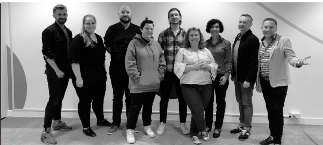
Kick-off meeting of project 'R.I.S.E.'