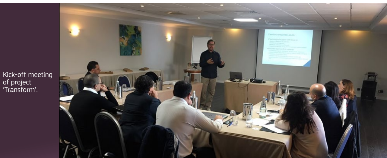
Kick-off meeting of project 'Transform'.