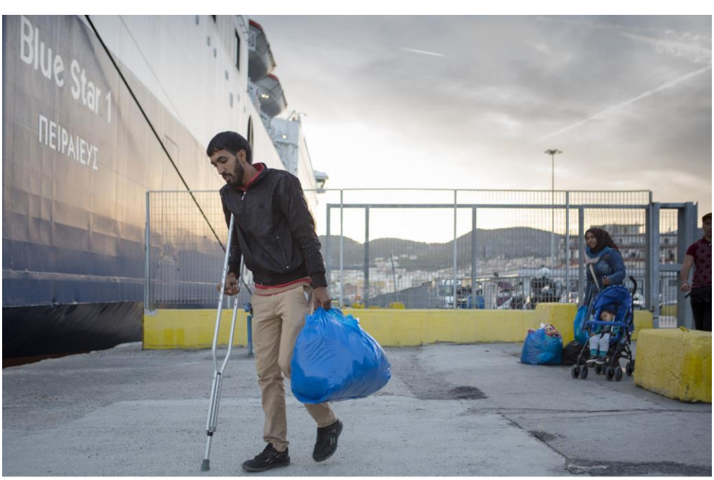
An asylum-seeker in Lesvos island prepares to board the ferry to Athens. October 2017.